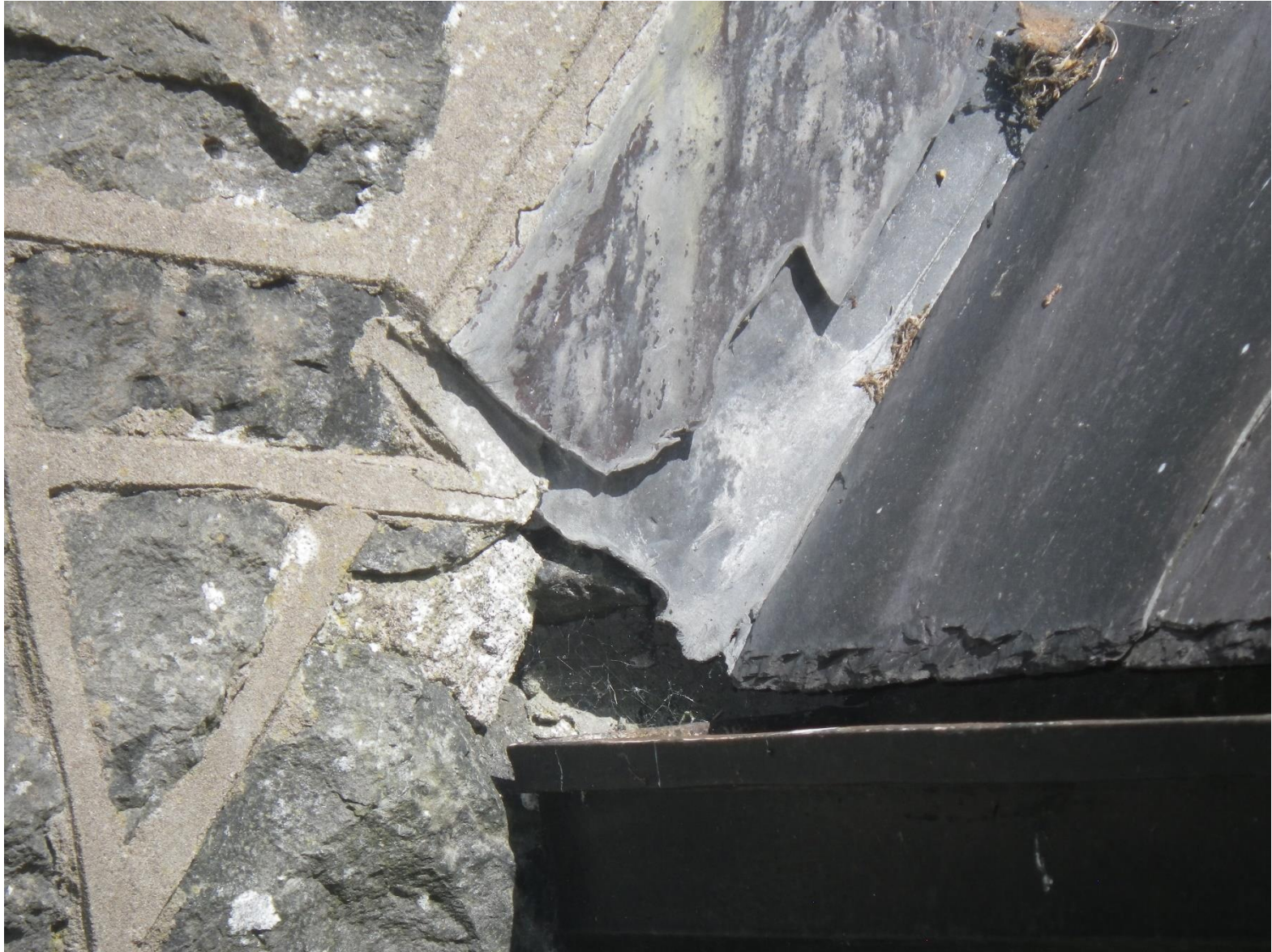
Poor lead detail at Porch roof