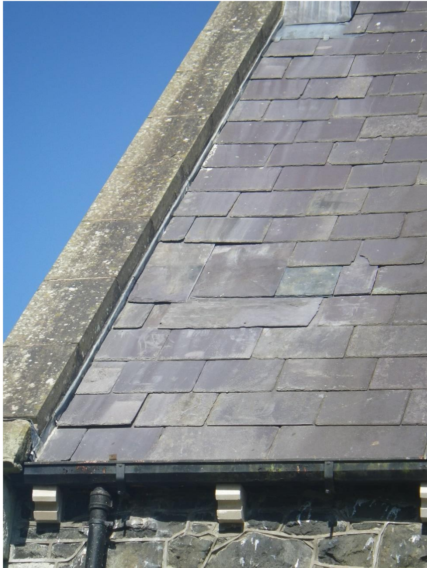
Wind uplift and repairs to Nave roof.